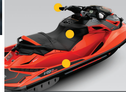
ERGOLOCK ™ SYSTEM