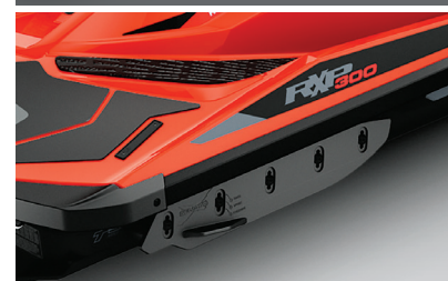
ADJUSTABLE REAR SPONSONS