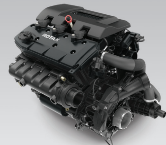
ROTAX ® 1630 ACE ™ ENGINE

Type Rotax 1630 ACE Intake system Supercharged with external intercooler Displacement 1,630 cc Cooling Closed-Loop Cooling System (CLCS) Reverse system Electronic iBR ® Starter Electric Fuel type 87 octane – minimum 91 octane – recommended