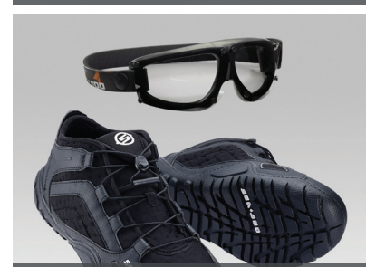
SEA-DOO RIDING SHOES & GOGGLES (OPTION)