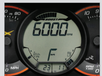
ALL-NEW X-Gauge with boost indicator

Introducing the best handling, performance-oriented watercraft on the market. With its Rotax ® 4-TEC ® race-proven, muscle engine and the revolutionary new T 3 Hull ™ for more traction on the water, it gives the rider all the advantages. The new Ergolock ™ system, includes a narrow racing seat, adjustable handlebars and angled footwells that have been tweaked to minimize upper body fatigue and provide more leverage. Add on the adjustable sponsons and trim tabs, and you'll have all the advantages to leave everyone behind on a buoy course or in offshore chop.