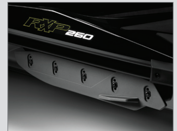
ALL-NEW Adjustable rear sponsons