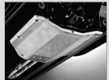
NEW intake grate and ride plate