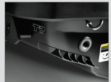
ALL-NEW Trim tabs