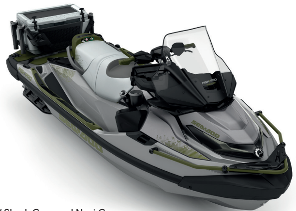
NEW Shark Grey and Nori Green