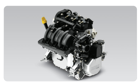
Rotax 900 ACE - 90 Engine

A telescopic steering system that optimizes the experience for varying rider sizes.