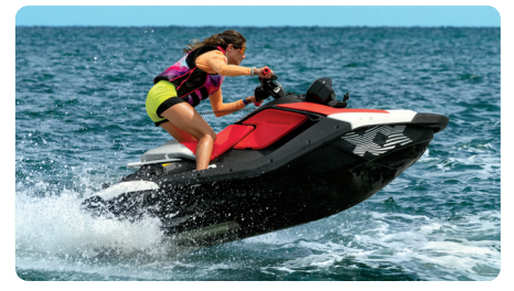
Extended Range VTS (Variable Trim System)

Trixx Mode unlocks new water acrobatics like reverse donuts to add even more show-stopping fun to the ride. Trixx Mode offers more thrust in reverse to perform maneuvers more easily.