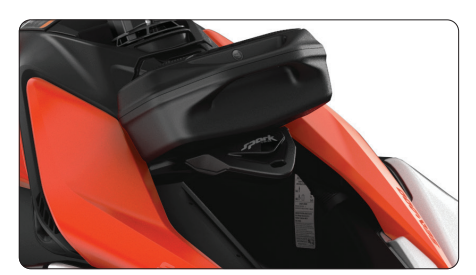
BRP Audio - Portable System (optional)

The Rotax 900 ACE – 90 gives crisp acceleration with impressive fuel economy.