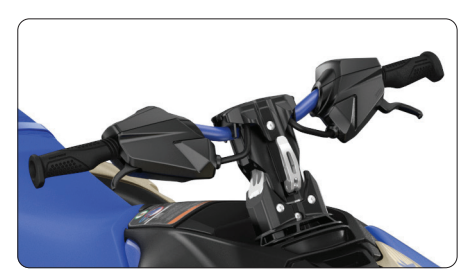
iBR - Intelligent Brake & Reverse

The BRP Audio portable system provides higher quality sound on and off the water, featuring Concert, Ride and Home modes. Equipped with a heavy duty mounting bracket.