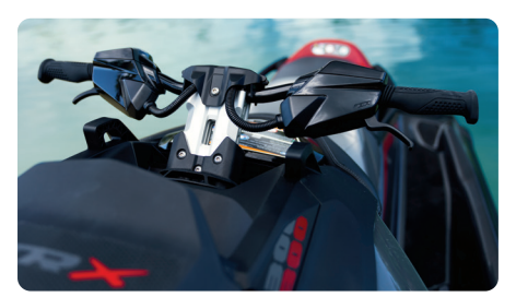
Low-Rise Racing Handlebars Creates a more streamlined, race oriented riding position.