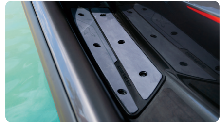
Angled Footwell Wedges Lined with premium carpets, provides superior foot grip.