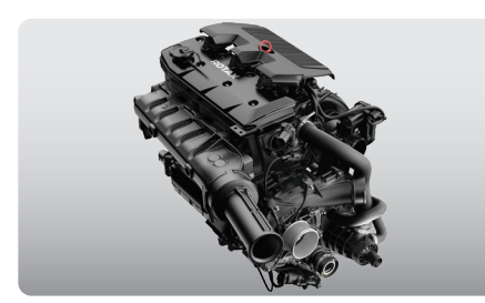
Rotax 1630 ACE - 300 Engine The powerful Rotax 1630 ACE - 300 engine levels up your performance to your liking by delivering high efficiency and world-class acceleration.