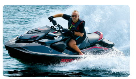
Ergolock Two-Piece Racing Seat Tacky surface and back support enhances grip during performance riding.