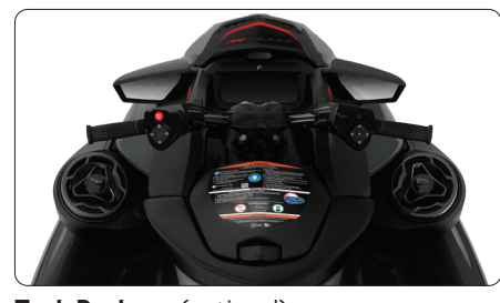
Tech Package (optional) Levels up entertainment and functionality on the water. It includes a factory-installed, truly waterproof Bluetooth audio system, a 7.8" colour display and a USB port.