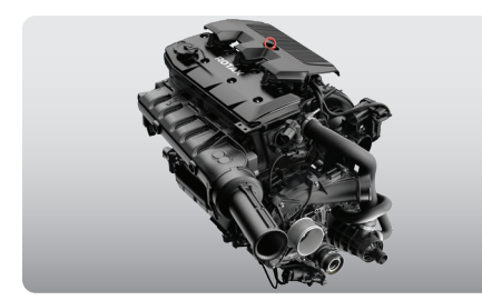
Rotax 1630 ACE – 230 Engine This powerful engine comes standard with a supercharger and external intercooler.