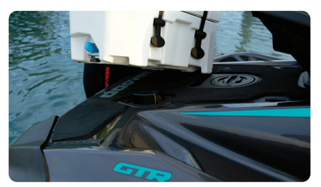
Swim Platform with Integrated LinQ System Exclusive quick-attach system on a large swim platform that allows for easy installation of storage accessories.