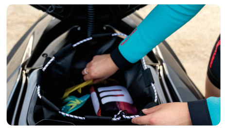
Large Front Storage An impressive 38 gallons of sealed storage space allows riders to safely stow belongings while riding.<sup>1</sup>