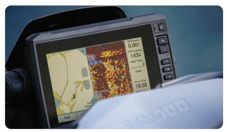
Garmin 7" Touchscreen GPS & Fish Finder A top-of-the-line navigation, charting and fish-finding system using an in-hull transducer and mid-CHIRP sonar. Includes token for access to free upgraded regional maps.