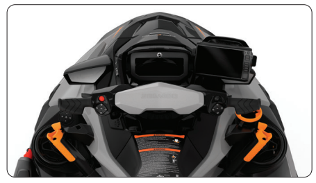
Tech Package Levels up entertainment and functionality on the water. It includes a factory-installed, truly waterproof Bluetooth audio system, a 7.8" colour display and a USB port.