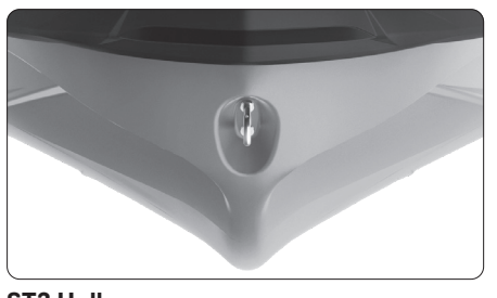
ST3 Hull An innovative hull that sets the benchmark for rough water handling, stability, and offshore performance.