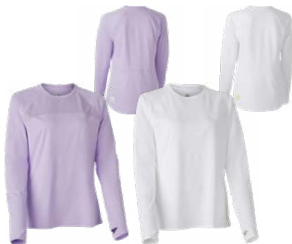
Lilac (25), White (01)