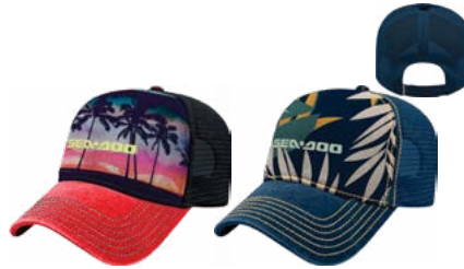
Lava Red (17)