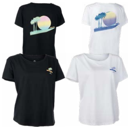
Black (90), White (01)