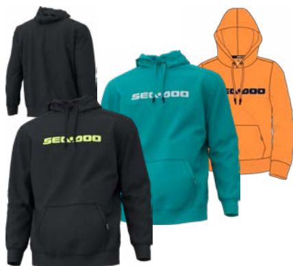
Black (90), Aqua (76), Orange (12)