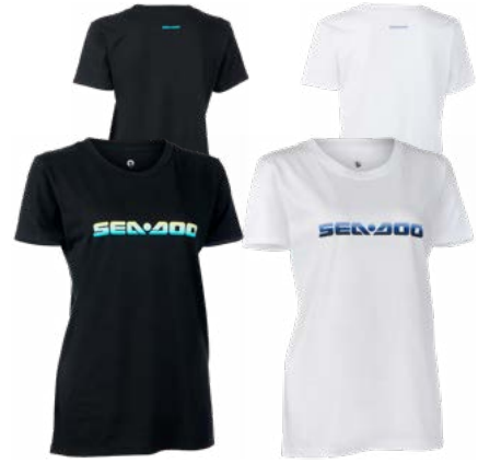
Black (90), White (01)