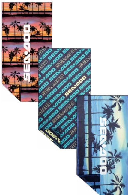
Black with Graphics (94), Hi-Vis Yellow (26), Royal Blue (83)

NEW Sea-Doo Quick Dry Towel by Slowtide † 288062 One size