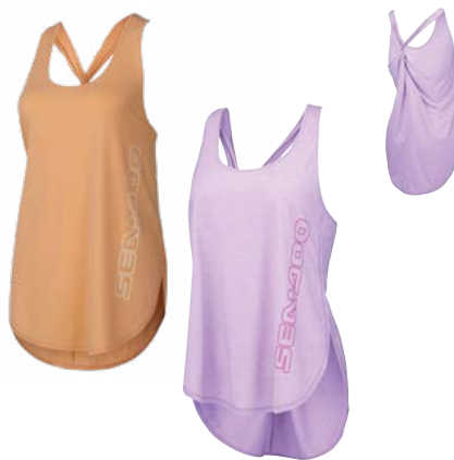
Coral (13) Lilac (25)