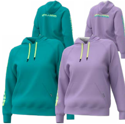
Aqua (76), Lilac (25)