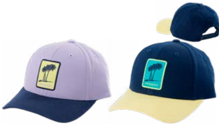
Lilac (25), Navy (89)