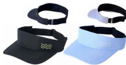
Black (90), Lilac (25)