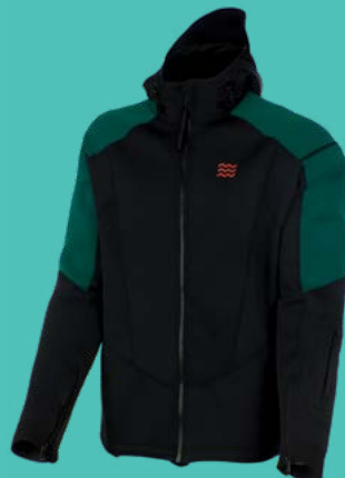
PERFORMANCE RIDING JACKET The perfect mix between protection and comfort