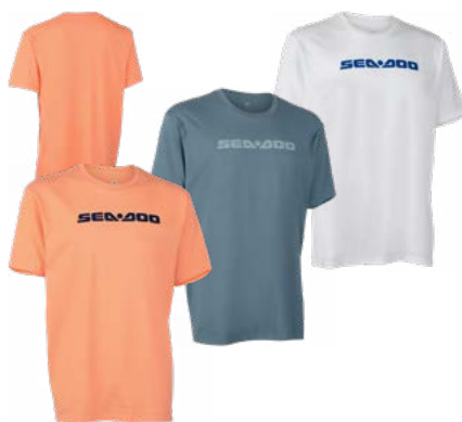
Amber (95), Denim Blue (79), White (01)