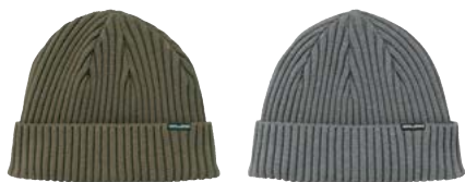
Army Green (77) Grey (09)