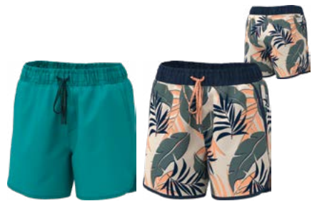
Aqua (76) Ivory (97)