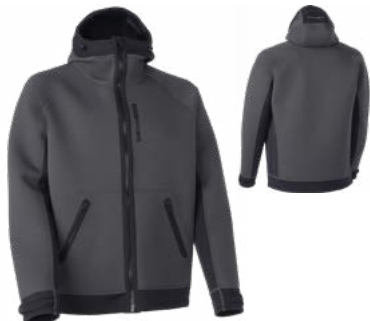
Charcoal Grey (07)