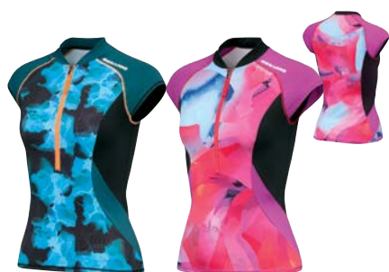
Teal (74) Violet (41)