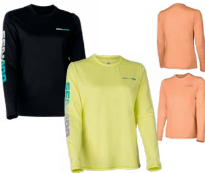
Black (90), Hi-Vis Yellow (26), Coral (13)