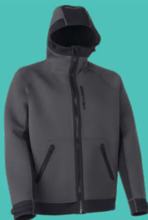
NEW NEOPRENE RIDING JACKET Ultimate protection from the elements

Our neoprene riding gear provides exceptional protection and comfort on every ride.