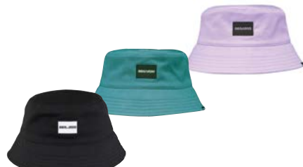
Black (90) Teal (74) Violet (41)