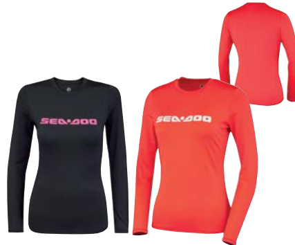
Black (90) Lava Red (17)