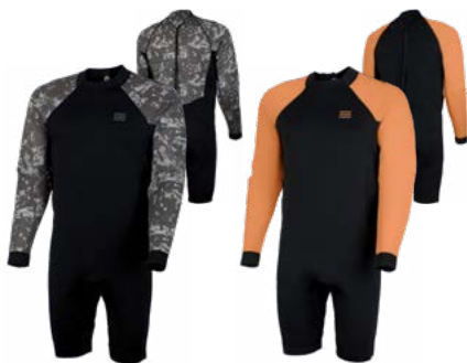
Black with Graphics (94)