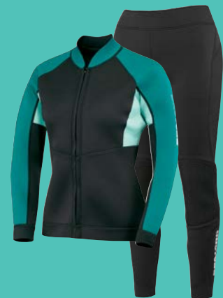
MONTEGO JACKET & PANTS Ultimate protection for performance riders and cold weather