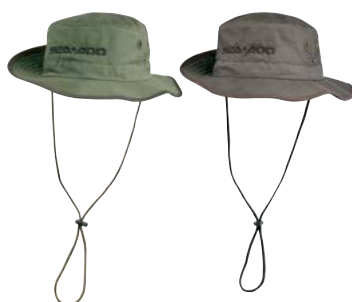
Army Green (77) Brown (04)