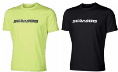
Hi-Vis Yellow (26) Black with Graphics (94)