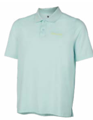
Light Blue (81)