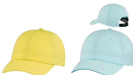
Hi-Vis Yellow (26) Ice (38)