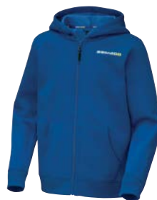
Royal Blue (83)