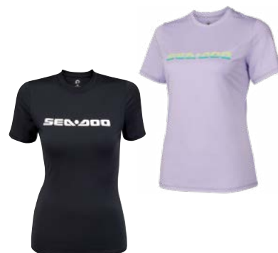
Black (90) Lilac (25)