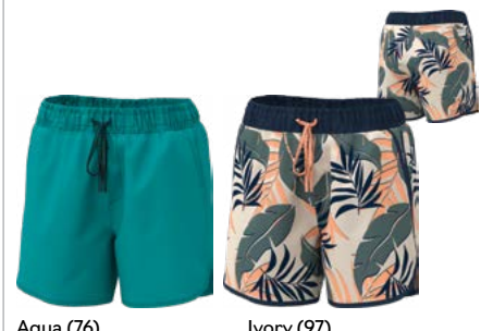
Aqua (76) Ivory (97)