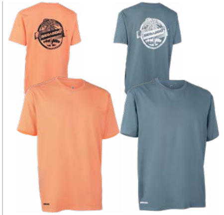
Amber (95), Denim Blue (79)