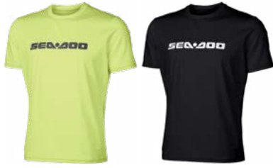
Hi-Vis Yellow (26) Black with Graphics (94)