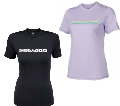
Black (90) Lilac (25)