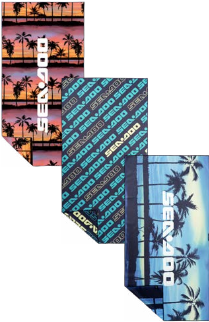
Black with Graphics (94), Hi-Vis Yellow (26), Royal Blue (83)

NEW Sea-Doo Quick Dry Towel by Slowtide † 288062 One size