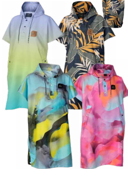
Hi-Vis Yellow (26)