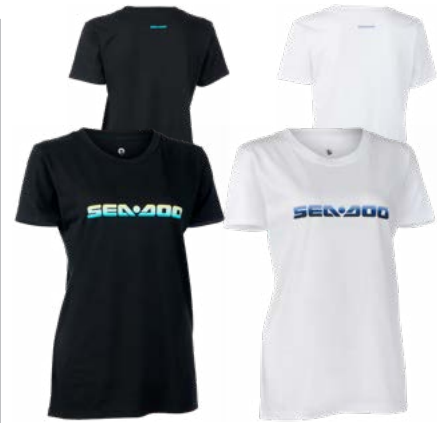
Black (90), White (01)