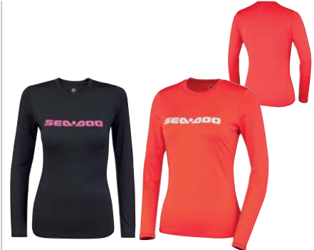
Black (90) Lava Red (17)