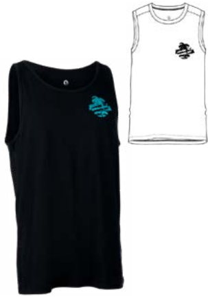
Black (90), White (01)