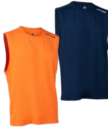
Orange (12), Navy (89)