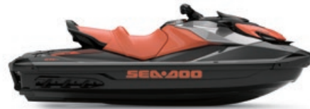
GTI™ SE 130