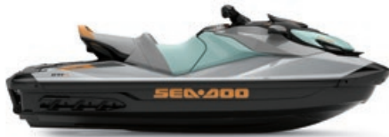
GTI™ SE 170