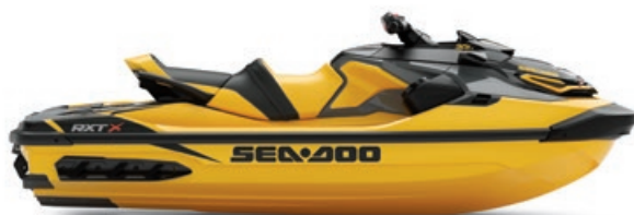
● Millennium Yellow