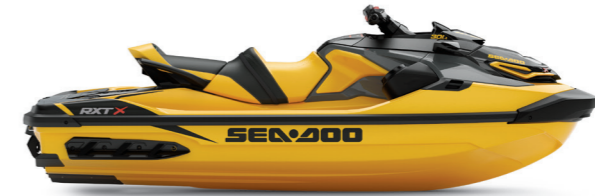
● Millennium Yellow