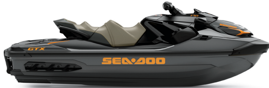
Eclipse Black & Orange Crush