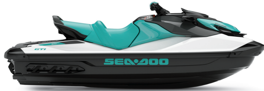
White & Reef Blue