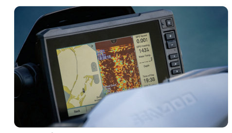
Garmin<sup>†</sup> 7" Touchscreen GPS & Fish Finder A large 7" touchscreen top-of-the-line navigation, charting and fish-finding system using an in-hull transducer and mid-CHIRP sonar. Includes token for access to free upgraded regional maps