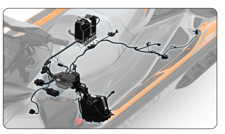
Advanced Battery System With dual batteries and a 650-watt voltage generator, even the most demanding electrical needs are sure to be met.

Integrated Washdown Use the quick-connect hose to clean the rear of your watercraft and cooler.