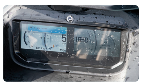
Full-Color 7.8" Wide Display (Optional) Full-color display with incredible visibility and a new level of functionality. Bluetooth and smartphone app integration provides music, weather, navigation and more.