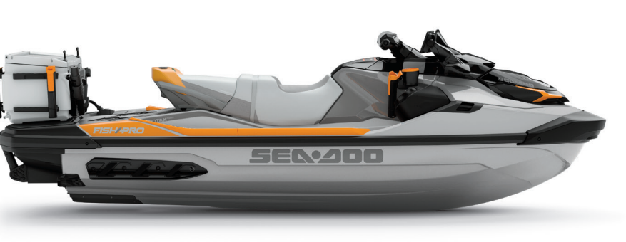
NEW Shark Grey & Orange Crush