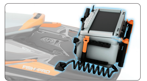
Quick-Connect Livewell Turn the LinQ Fishing Cooler into a livewell in seconds. An integrated pump constantly feeds fresh water into the reservoir keeping your catch or your bait alive all day.