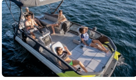
Sport lounge area

Equipped with watersports essentials like a quick-attach inflatable holder, rearview mirror and ski-mode that delivers repeatable launches and maintains a consistent pace.