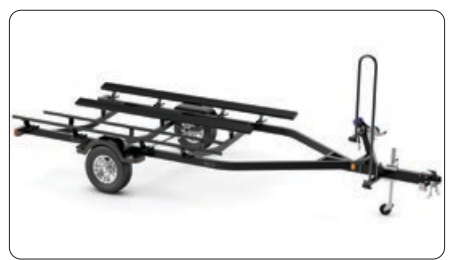
Switch painted trailer included Every Switch model comes complete with high-quality, powder coated trailer included straight from the dealership.

With it's center hull deeper in the water, the unique Tri-Hull design allows for nimble and precise handling, exciting performance and improved stability.