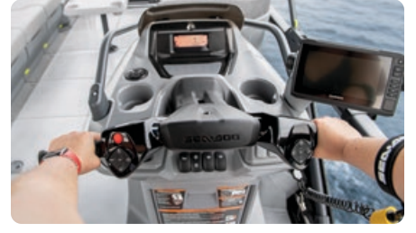
Unique driving experience

Fun, simple and stress-free handling. Easy to steer and easy to dock with intuitive Sea-Doo handlebar controls. iBR Intelligent Brake & Reverse stops the boat sooner and improved maneuverability.1