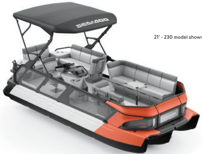
21' - 230 model shown