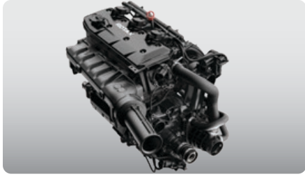
Powerful Rotax 1630 ACE™

Every Switch model comes complete with high-quality, powder coated trailer included straight from the dealership.