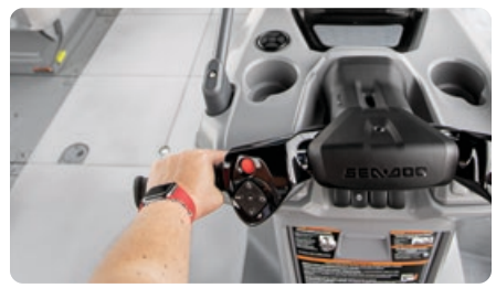
Unique driving experience

Fun, simple and stress-free handling. Easy to steer and easy to dock with intuitive Sea-Doo handlebar controls.<sup>1</sup>