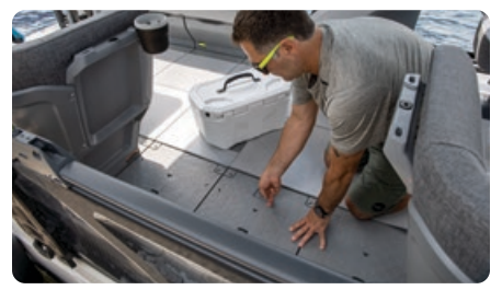
Switch modular deck

Fun, simple and stress-free handling. Easy to steer and easy to dock with intuitive Sea-Doo handlebar controls.<sup>1</sup>