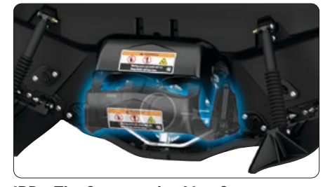
iBR - The first true braking & reverse system on a pontoon

Proven to be reliable, this jet propulsion system offers an outsized fun-factor with a level of maneuverability never seen on a pontoon boat.