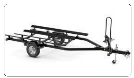
Switch painted trailer included

With it's center hull deeper in the water, the unique Tri-Hull design allows for nimble and precise handling, exciting performance and improved stability.