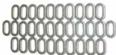
Front and Rear Deck Hardware Upgrade Kit