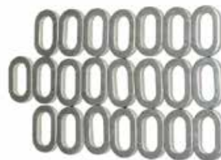
Main Deck Hardware Upgrade Kit