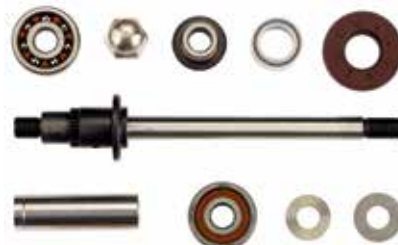
Supercharger Repair Kit